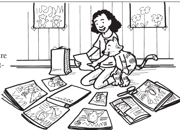
Photo walk. Go for a walk together, and let your child take pictures of scenes that might lead to a story. She could snap a photo of a fire truck speeding past with its lights flashing or of a frozen lake shimmering in the sun. At home, she

can look at the pictures and write a story about a courageous rescue or an ice hockey game.